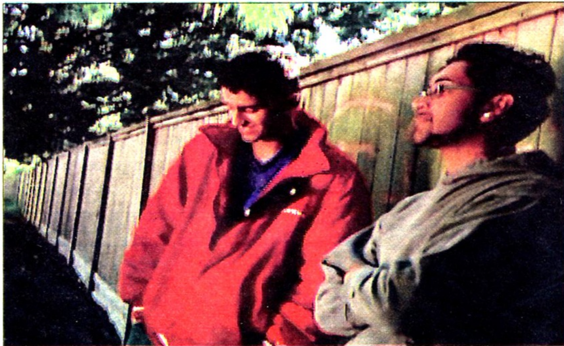
The Vancouver-made documentary Warrior Boyz examines culture among south Asians.